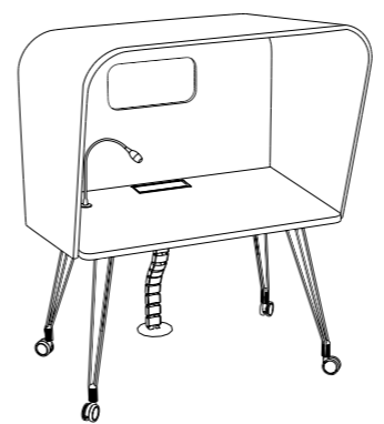
TUK15480 L154 W80 H118 Top L110 W60 H72